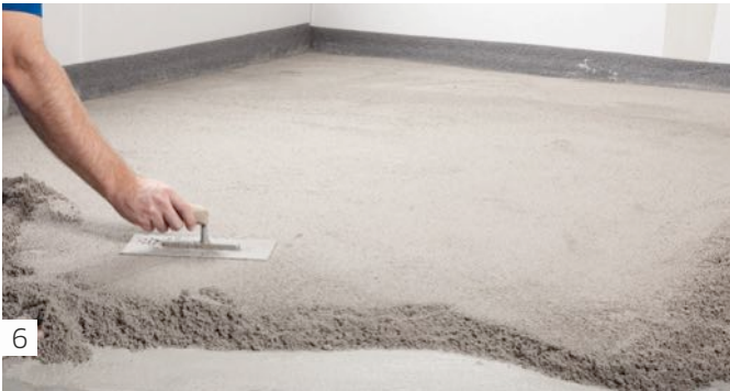
Smooth. Ready for installation after 12 hours