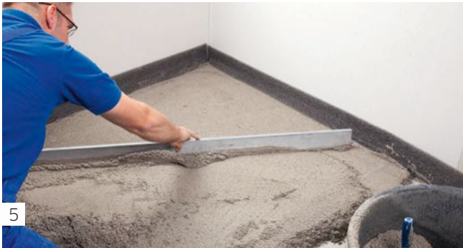
Compress and trowel up