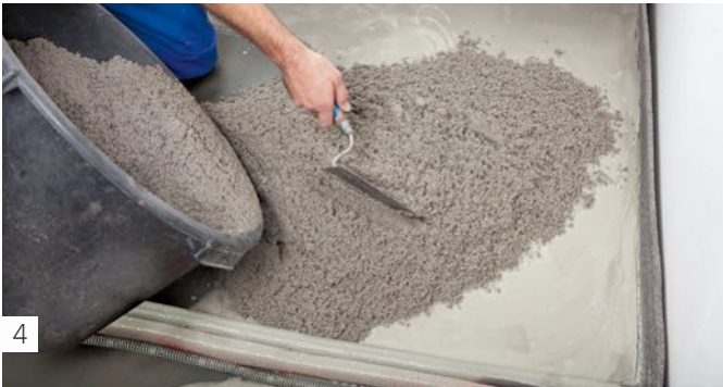
Spread the mixed BLANKE BASEMAX wet in wet