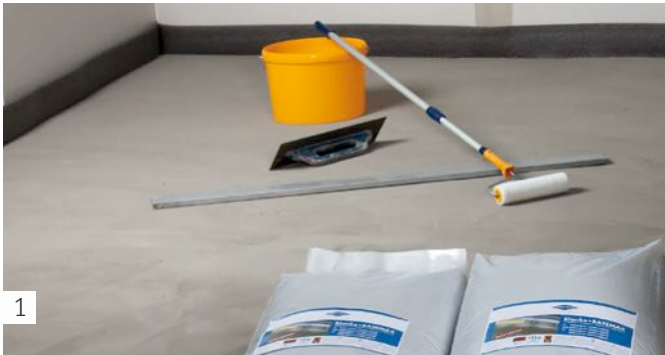
Before starting, lay out tools and material