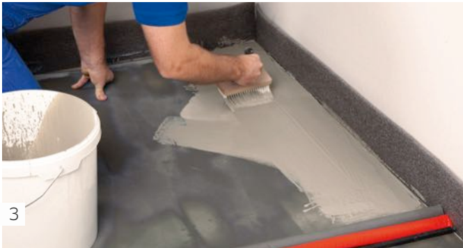
Application of the mixed adhesion bridge