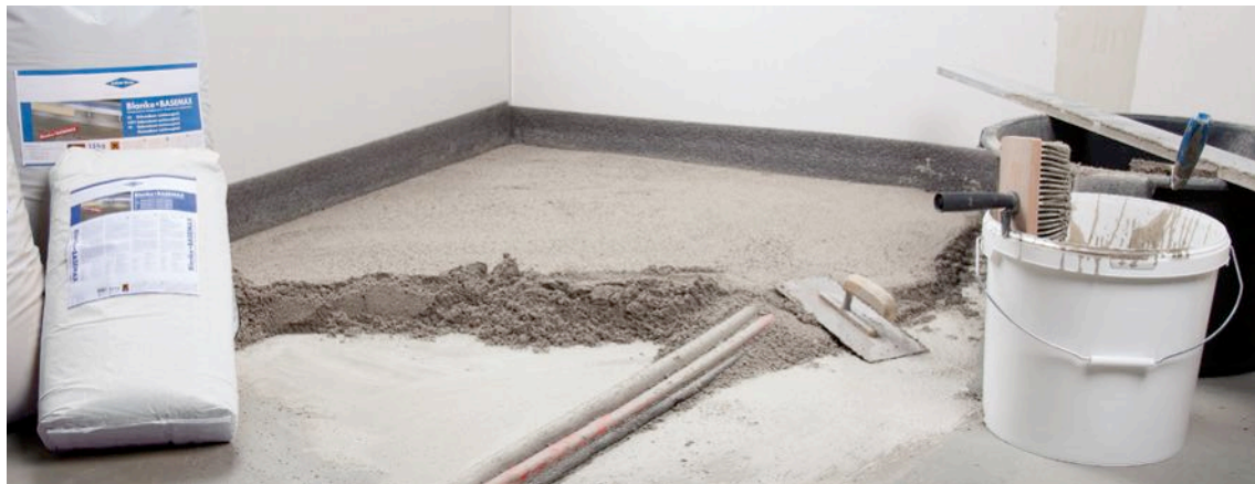
Easy incorporation of pipes and cables

BLANKE BASEMAX consists of a light filler in the form of expanded glass granulate and a cement-based bonding agent. Mixing with water creates the easy levelling from the two components which binds with the uneven surfaces – no matter whether concrete, screed, chipboard or wood flooring – it can be levelled from just 5 mm right up to 100 mm. BLANKE BASEMAX distinguishes itself through its extreme low weight properties, which only accounts to 25% of a comparable conventional screed. After just 12 hours, BLANKE BASEMAX is set and the Blanke flooring systems can be directly bonded and installed.